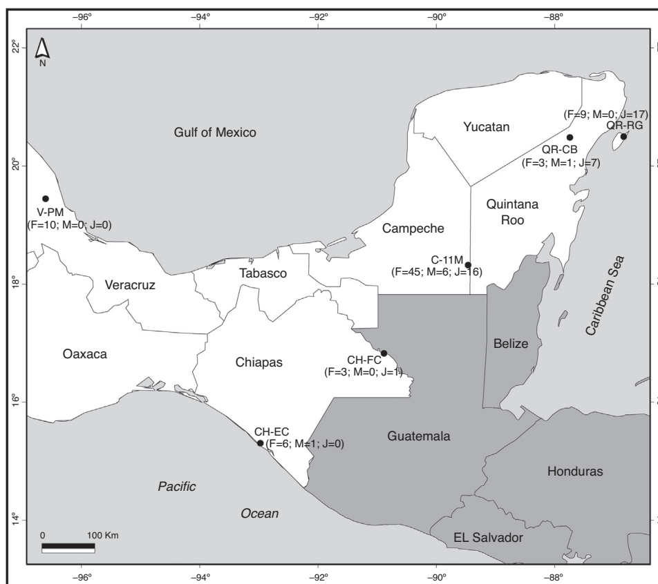
Figure 1. Map of sites where Brachypelma vagans was observed in Southeast Mexico. F, numbers of female individuals; M, number of male individuals; J, number of juvenile individuals. For codes of sites see Table 1. The number of wandering males found close to but not inside each sampling area is not considered in this figure.

in the Lacandona rainforest. In Campeche, we visited 1 site (11 de Mayo; C-11M; 18°18'N, 89°27'W, 281 masl) close to the Calakmul Biosphere Reserve. In Quintana Roo, we visited 2 sites, 1 on the mainland (Coba; QR-CB; 20°28'N, 87°44'W, 13 masl) and 1 on Cozumel Island (Rancho Guadalupe; QR-RG; 20°29'N, 86°50'W, 17 masl). We also recorded data from a site in Veracruz (Paso de Milpa; V-PM; 19°26'N, 96°36'W, 260 masl). Collections were made at the beginning of the rainy season for Chiapas and Yucatán Peninsula, which is between May and July. The start of the rains coincides with the reproductive season. All the sites studied were rural communities with similar ecological characteristics: deep clay soil with little vegetation, roots, and limestone rocks (Machkour-M'Rabet et al., 2005, 2007). Climatic characteristics were very similar for all study sites (Table 1).